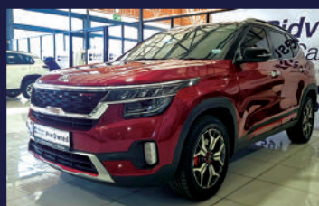
2020 KIA SELTOS 1.4T DCT GT-LINE