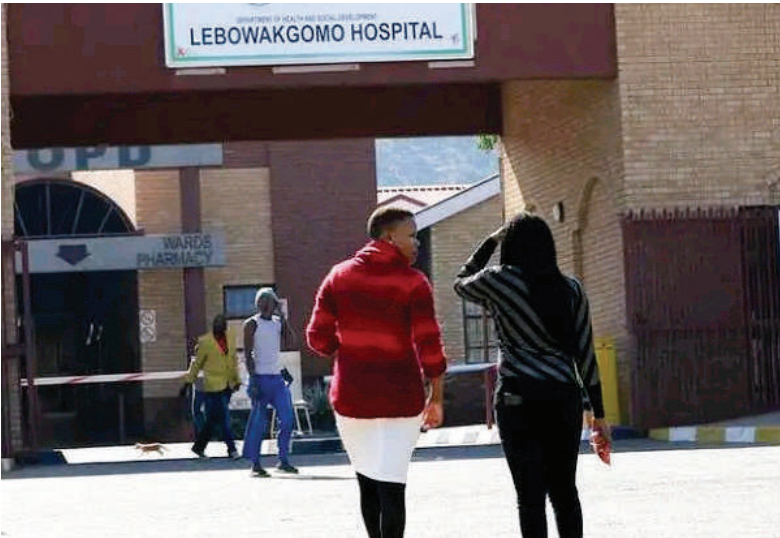
The Health Department in Limpopo condemned with strongest possible terms intimidation of staff and patients at Lebowakgomo Hospital.