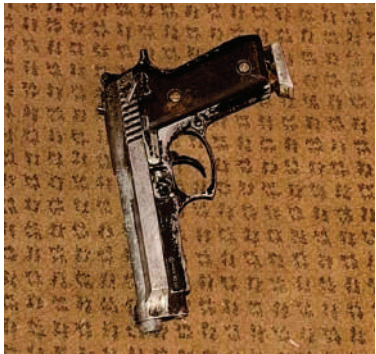
Unlicensed firearms were confiscated by the police during the Limpopo Provincial Operation Shanela.

R1250-00 in cash, 339 packets of counterfeit goods, 0.59 kg of dagga and 5 vehicles. “Furthermore, during the operation, the police conducted extensive searches in 1502 premises, 12408 persons were also searched, 51 unlicensed liquor premises searched, 77 scrapyards inspected, 6006 vehicles searched, 5096 Informal businesses were also inspected,” informed Ledwaba. He confirmed that the suspects have appeared before their respective courts. The Provincial Commissioner of the Police in Limpopo, Lieutenant General Thembi Hadebe, praised all members of the SAPS and other stakeholders involved in the operation, highlighting their efforts to combat crime in the province.