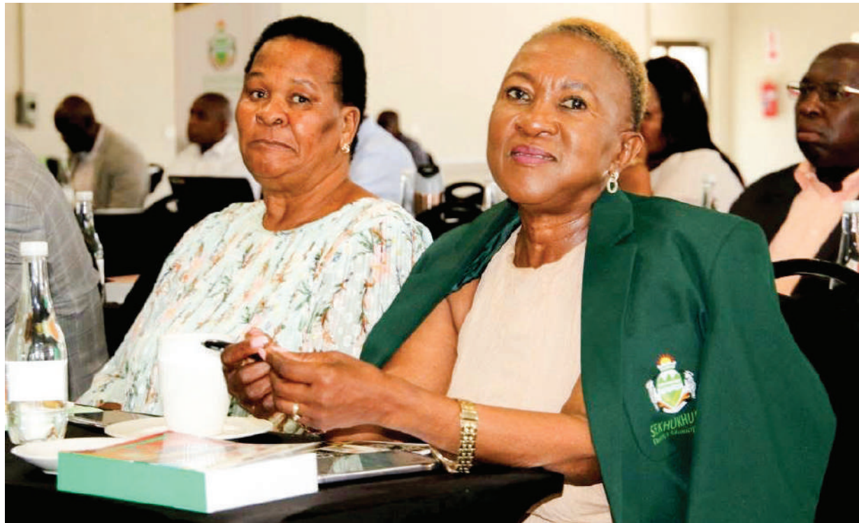
Some of the SDM entourage paying attention during the municipality's Annual Lekgotla held at Boeketlong Lodge in Mogorwane Village.