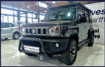
2024 SUZUKI JIMNY 1.5 GLX A/T 5DR

27 Hereford Street Groblersdal, Limpopo Tel: 013 591 4199