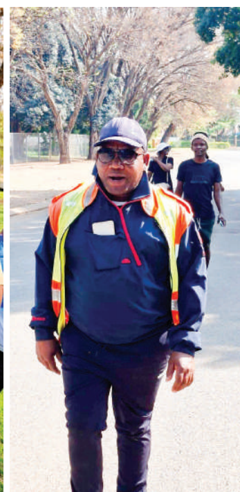
LDARD employees in the Sekhukhune and Capricorn Districts participating during the 4km Fun Walk in Marble Hall.

"Regular exercise is known to improve heart health, build stronger muscles and bones, strengthen the immune system, and reduce stress. It sharpens focus, enhances mental well-being, and helps manage