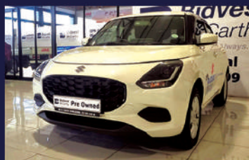
2025 SUZUKI SWIFT GL+ MANUAL