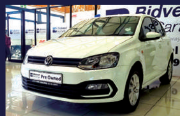
2025 VOLKSWA- GEN POLO VIVO PA 1.6 LIFE TIPT