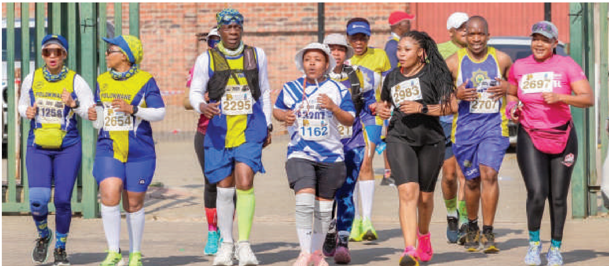
Some of the participants during the race.