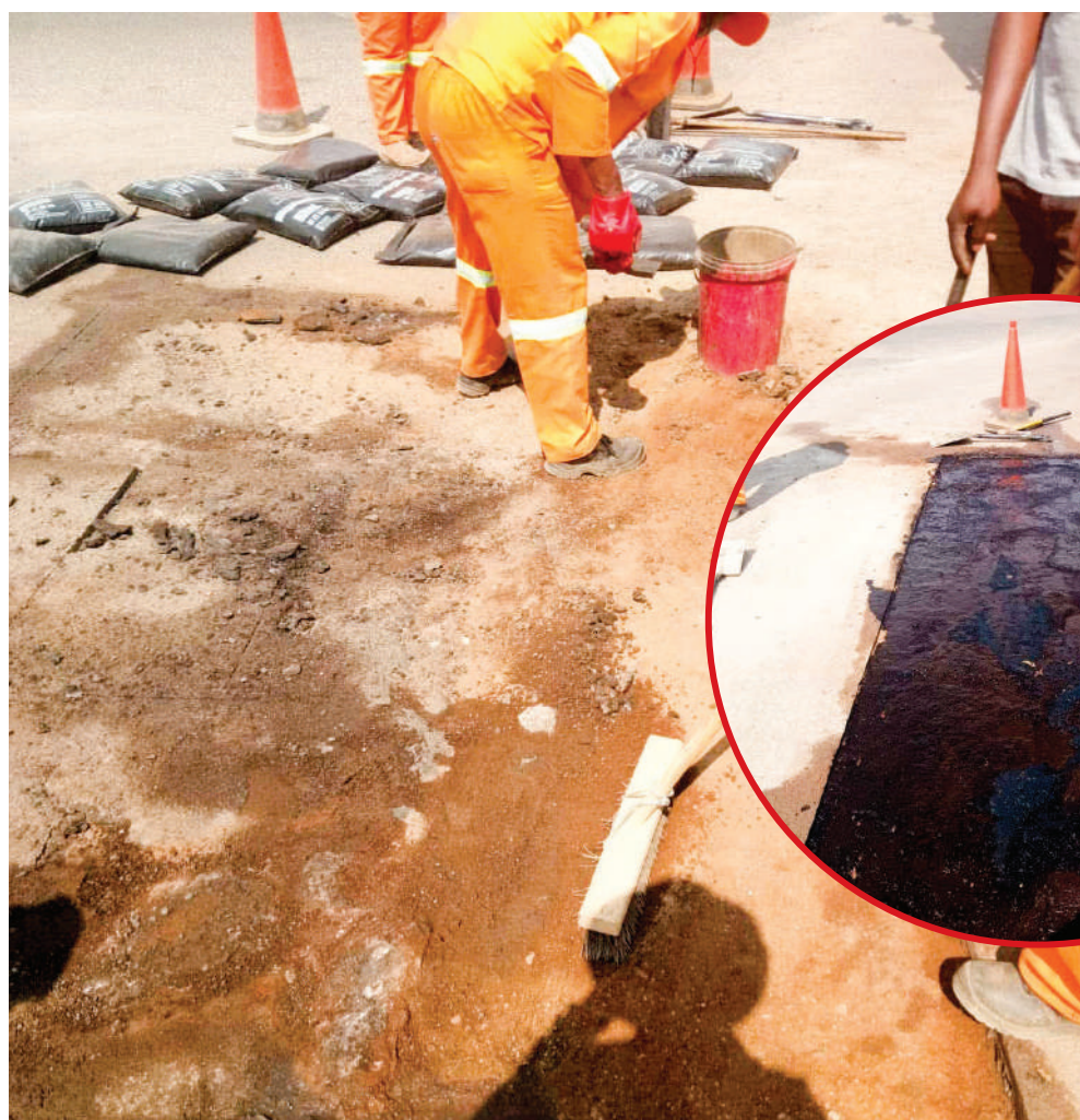
The Department of Public Works, Roads and Infrastructure maintenance team busy improving the conditions of the R25 Road between Dennilton and Groblersdal.