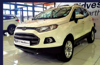
2014 FORD ECO- SPORT 1.0 ECO- BOOST TITANIUM