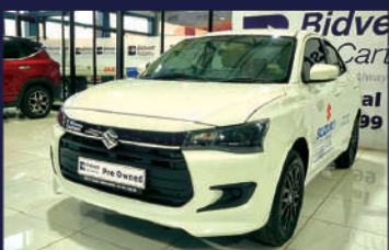
2025 SUZUKI DZIRE 1.2 GL+ CVT