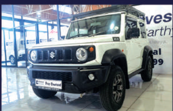
2023 SUZUKI JIMNY 1.5 GLX A/T