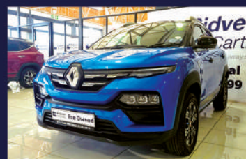
2022 RENAULT KIGER 1.0T INTENS CVT