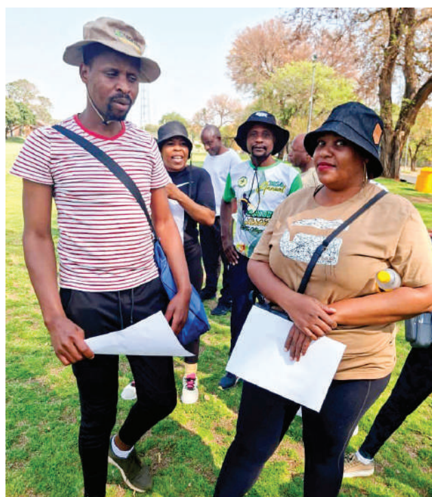
Tug of War was among a range of activities featured during the LDARD Wellness Wednesday programme organized at Laerskool Marble Hall.

According to the department, the collaborative effort underscores the importance of prioritizing employee well-