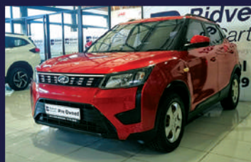
2019 MAHINDRA XUV300 1.2T (W6)