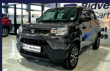
2025 SUZUKI S-PRESSO 1.0 GL+ AMT