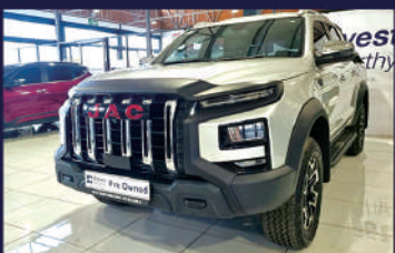
2024 JAC T9 2.0 CTI SUPER LUX 4X4 P/U D/C AT