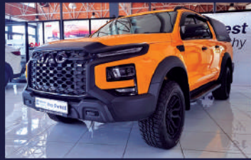
2024 JAC T9 2.0 CTI SUPER LUX 4X4