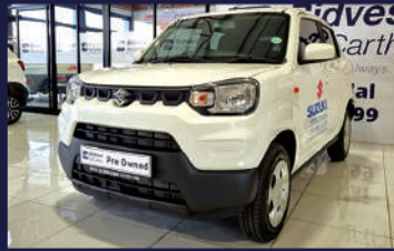
2025 SUZUKI S-PRESSO 1.0 GL MANUAL