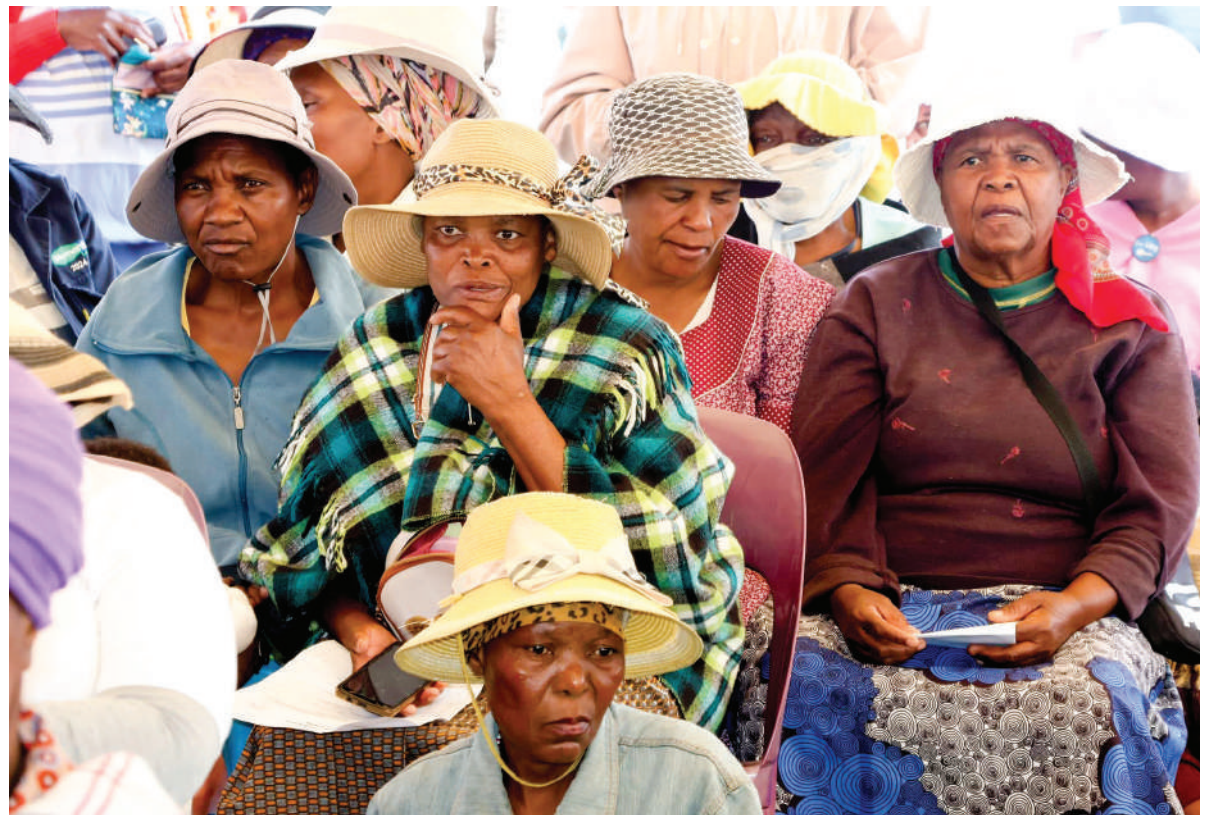
Residents of EMLM Ward 23 out in numbers attending the launching of the Indigent Awareness Campaign held at Sephaku Village.