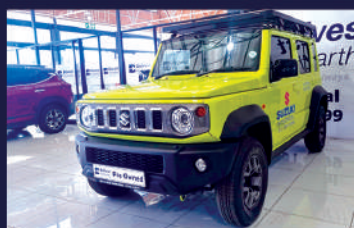
2025 SUZUKI JIMNY 1.5 GLX A/T