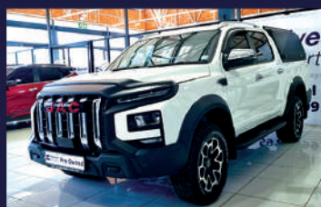
2025 JAC T9 2.0 CTI SUPER LUX 4X4