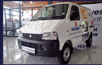
2024 SUZUKI EECO 1.2 PV